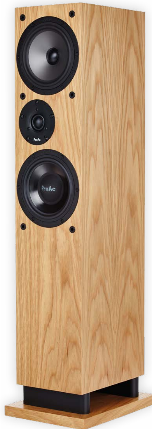
Shown in Natural Oak veneer