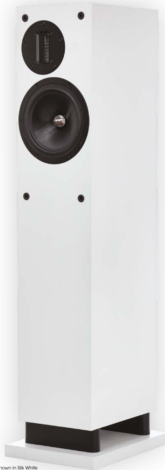
Shown in Silk White