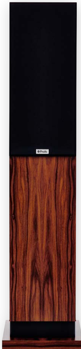
Shown in Rosewood veneer

The D20 can be supplied with ProAc's proven dome tweeter if preferred.