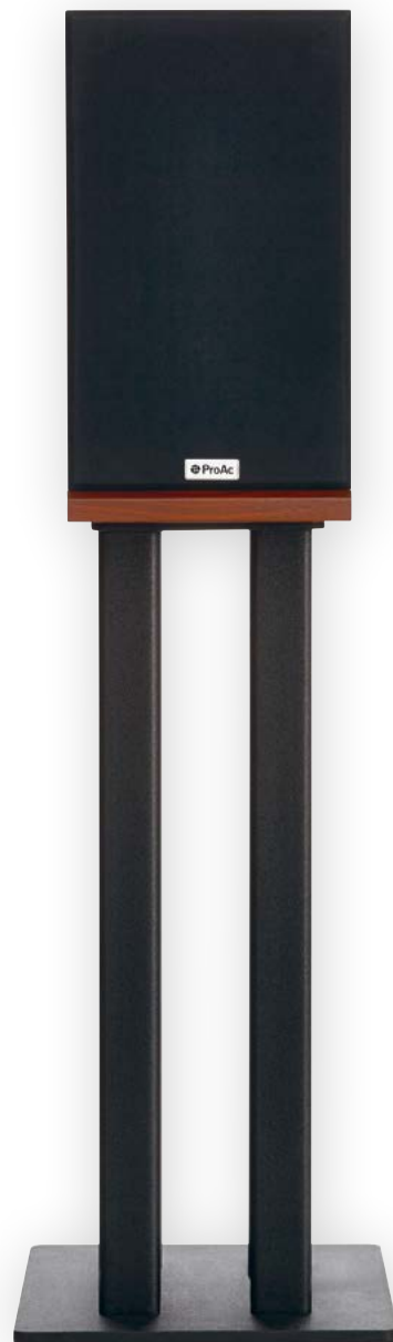
Shown in Cherry wood veneer

Sound quality from the D2 is one of extreme transparency; a lush and potent bass response and a silky detailed high frequency. The D2 also have a huge sound stage with pinpoint imagery. The speakers are designed to sit on high mass stands from 18" high depending on your seating position.