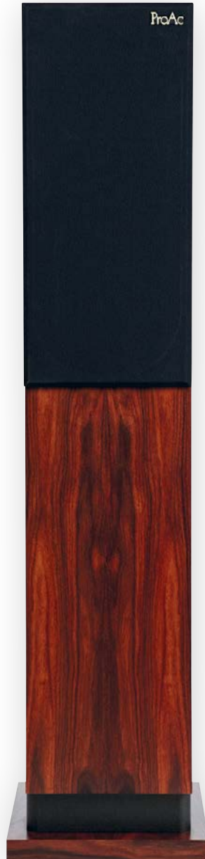
Shown in Rosewood veneer

Once set up using our own spikes, which are designed to penetrate even thick carpet and when partnered with quality electronics, the exceptional performance of the D30 can be fully realised. Offering clean powerful bass, an uncoloured, open midrange and a sweet, detailed high frequency response from either the ribbon or dome tweeter, the Stewart Tyler designed D30 offers a wonderfully natural and musical performance with pinpoint imagery that will appeal to audiophiles and music lovers all over the world.