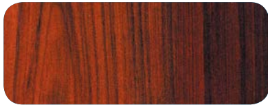
Rosewood (extra cost option)