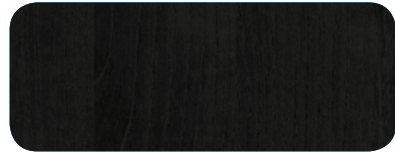
Black Ash (standard)

Wood is a natural resource and the veneer samples shown should be viewed as a guide only. Colour and grain patterns are subject to variation.