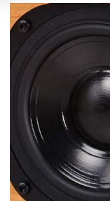
Shown in Cherry wood veneer