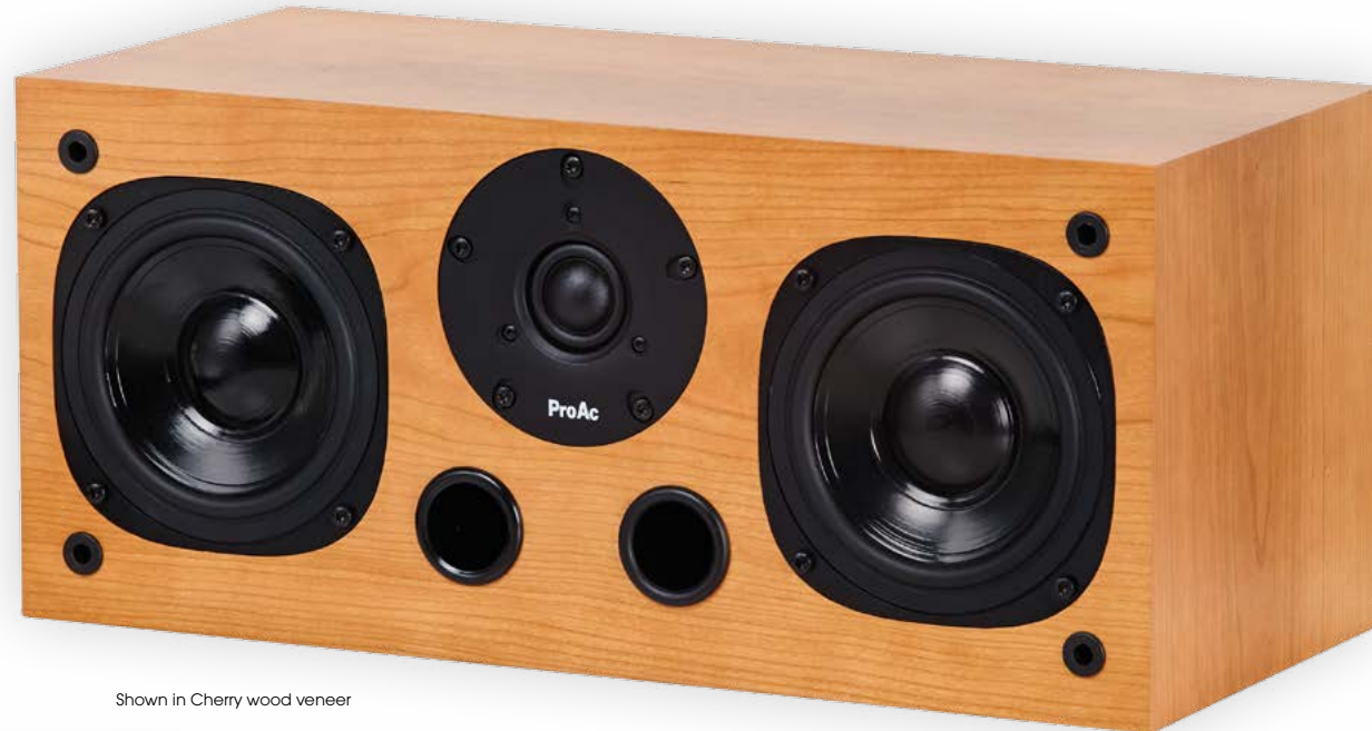
Shown in Cherry wood veneer

We urge you to compare the Centre Voice with other centre channel speakers, We are sure you will find the ProAc crystal clear on voice and rich, sweet and detailed on music.